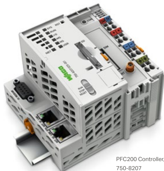
PFC200 Controller, 750-8207